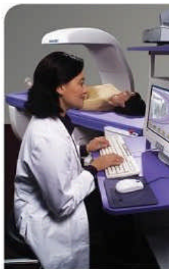
Bone Density Testing